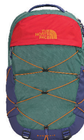
The North Face Backpack *Colors may vary