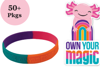
Axolotl Vinyl Sticker AND Silicone Wristband