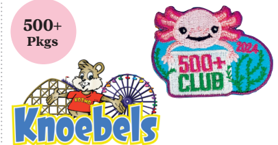
Knobels Day-August 9, 2024 OR $30 GO!Dough AND 500 Club Patch