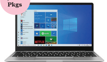
Laptop OR $125 GO!Dough

*GSHPA reserves the right to replace an item of equal or higher value.