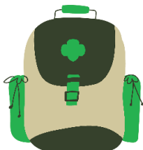
$250 Camp Credit OR $100 GO!Dough