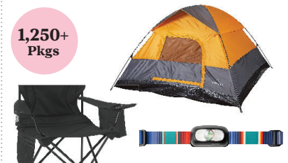
Camp Combo! Tent, Camp Chair, Headlamp *Colors may vary