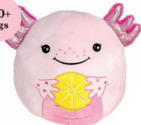
Axolotl Plush Pillow