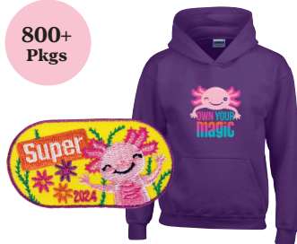
Hoodie AND Super Patch