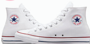
Customize Your Own Converse!