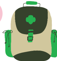
$250 Camp Credit OR $100 GO!Dough